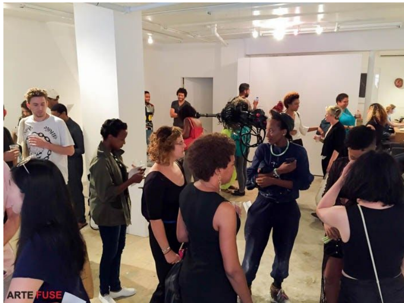
The crowd at the opening