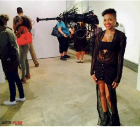
Artist Doreen Garner

model of a businessman holding a briefcase, acts as a “reminder that privilege is illusory and is available for those willing to accept it.” It also invites the audience to “take them [the chalk] as their own symbols of white male power...”