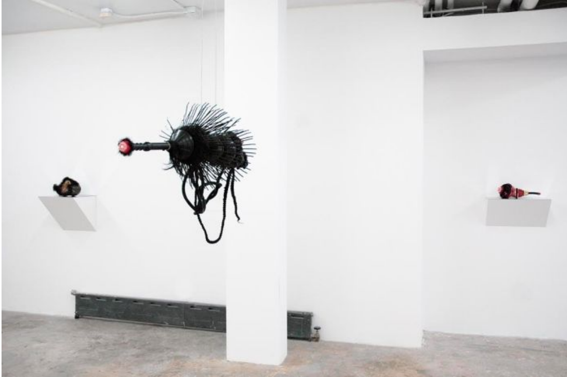
Installation shot of Pussy Don't Fail Me Now at Cindy Rucker Gallery