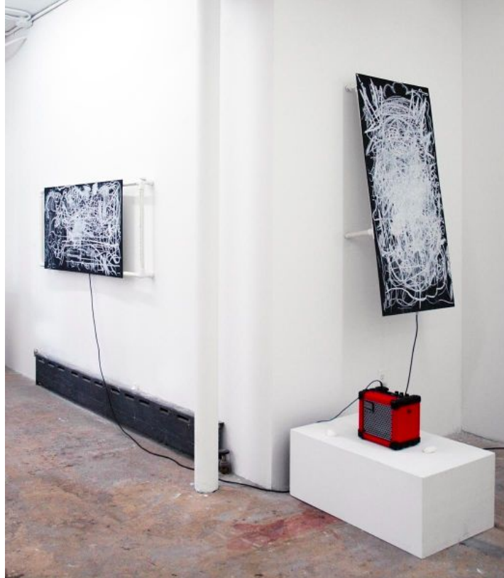
Pussy Don't Fail Me Now at Cindy Rucker Gallery